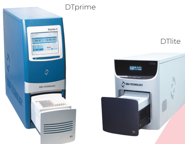
Fig. 1. Devices manufactured by DNA-Technology

DT devices manufactured by DNA-Technology R&P (DTlite, DTprime) (Fig. 1).